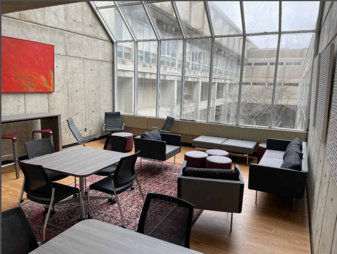
The new CoLA Lounge, Faner 2302